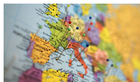
COUNTRY OF ORIGIN LABELLING FOR MEAT IN PROCESSED FOOD