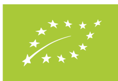
EU ORGANIC REGULATION PROPOSAL